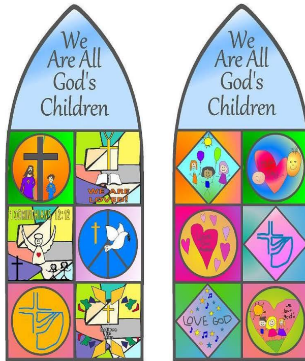
Left window panel drawings submitted by the children of the Manassas and Fairview congregations. Right window panel drawings submitted by the children of the Friendship congregation.

If anyone would like to be a delegate please contact Danny Rumpf at djrumf78@comcast.net .