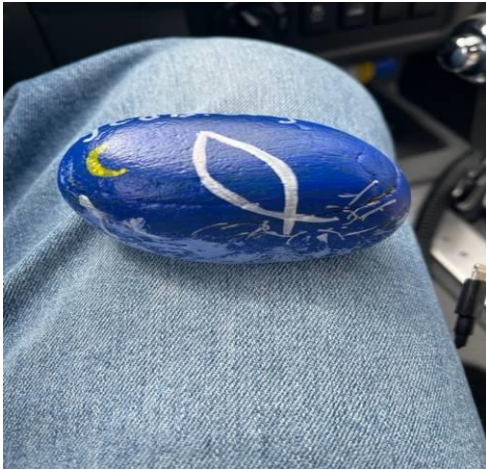
A Fisherman Wanted to Share What He Found